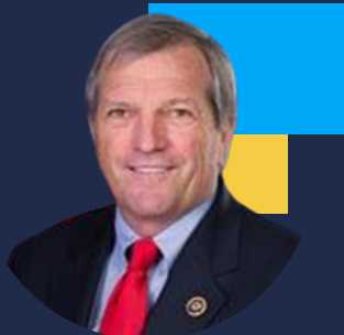
Health, Employment, Labor and Pensions Subcommittee