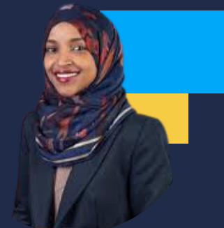
Workforce Protections Subcommittee