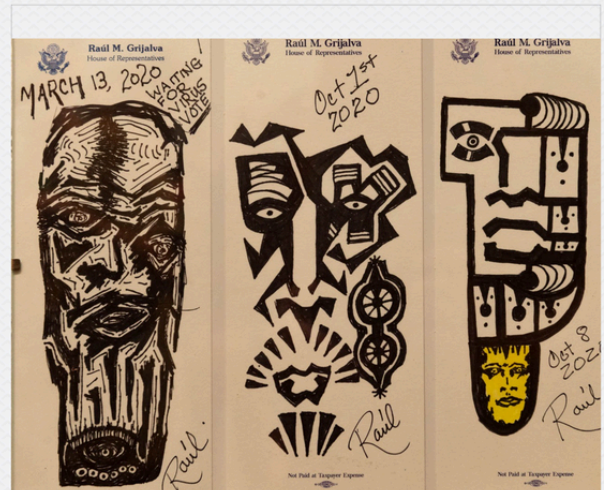
Rep. Grijalva's Artwork

“We sat next to each other for many years on the Committee on Education and Workforce, and I could always rely on him for a sense of optimism and humor while in the midst of some of the toughest legislative fights. In addition to being a proficient and talented doodler, he was a champion for his constituents and environmental justice for all. He was a fierce defender of unions and civil rights in the workplace.”