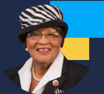
Higher Education and Workforce Development Subcommittee