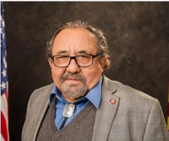
Rep. Raúl Grijalva (AZ-07)

The Committee is deeply saddened by the passing of Rep. Raul Grijalva (AZ-07) earlier this year. As we continue his work in Congress, may his dedication to workers and students continue to inspire us.