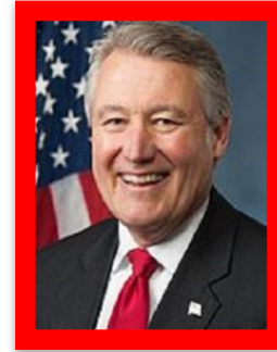
Rick W. Allen, Ranking Member

Kim Schrier Jahana Hayes Donna E. Shalala Susan A. Davis Frederica S. Wilson Mark DeSaulnier Joseph D. Morelle