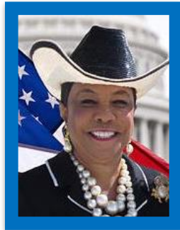
Frederica S. Wilson, Chair

Matters dealing with relationships between employers and employees, including but not limited to the National Labor Relations Act , the Labor-Management Relations Act , and the Labor-Management Reporting and Disclosure Act ; the Bureau of Labor Statistics; and employment-related health and retirement security, including but not limited to pension, health, other employee benefits, and the Employee Retirement Income Security Act .