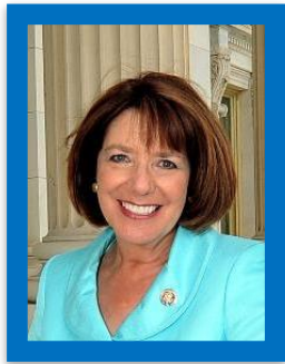
Susan A. Davis, Chair

Education and workforce development beyond the high school level, including but not limited to higher education generally, postsecondary student assistance and employment services, and the Higher Education Act , including campus safety and climate; adult education; postsecondary career and technical education, apprenticeship programs, and workforce development, including but not limited to the Workforce Innovation and Opportunity Act , vocational rehabilitation, and workforce development programs from immigration fees; programs related to the arts and humanities, museum and library services, and arts and artifacts indemnity; science and technology programs; and domestic volunteer programs and national service programs, including the Corporation for National and Community Service.