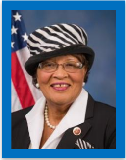
Alma S. Adams, Chair

Wages and hours of workers, including but not limited to the Davis-Bacon Act , the Walsh-Healey Act , the Service Contract Act , and the Fair Labor Standards Act ; workers' compensation, including but not limited to the Federal Employees' Compensation Act , the Longshore and Harbor Workers' Compensation Act , and the Black Lung Benefits Act ; the Migrant and Seasonal Agricultural Worker Protection Act ; the Family and Medical Leave Act ; the Worker Adjustment and Retraining Notification Act ; the Employee Polygraph Protection Act of 1988 ; trade, international labor rights, and immigration issues as they affect employers and workers; and workers' safety and health, including but not limited to occupational safety and health, mine safety and health, and migrant and agricultural worker safety and health.