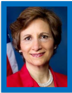
Suzanne Bonamici, Chair MAJORITY (7)

Matters relating to equal employment opportunities and civil rights generally; welfare reform programs, including but not limited to work incentive programs and welfare-to-work requirements; poverty and human services programs, including but not limited to the Community Services Block Grant Act and the Low Income Home Energy Assistance Program ; the Native American Programs Act ; school lunch and child nutrition programs; matters dealing with programs and services for the elderly, including but not limited to nutrition programs and the Older Americans Act ; adolescent development programs, including but not limited to those providing for the care and treatment of certain at-risk youth such as the Juvenile Justice and Delinquency Prevention Act and the Runaway and Homeless Youth Act ; and matters dealing with child abuse and domestic violence, including but not limited to the Child Abuse Prevention and Treatment Act and child adoption.