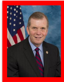
Tim Walberg, Ranking Member

Donald Norcross Joseph D. Morelle Susan Wild Lucy McBath Lauren Underwood Haley M. Stevens Joe Courtney Marcia L. Fudge Josh Harder Donna E. Shalala Andy Levin Lori Trahan Robert C. "Bobby" Scott