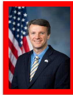
Ben Cline, Ranking Member MINORITY (4)

Raúl M. Grijalva Marcia L. Fudge Kim Schrier Jahana Hayes David J. Trone Susie Lee