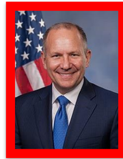
Lloyd Smucker, Ranking Member

Joe Courtney Mark Takano Pramila Jayapal Josh Harder Andy Levin Ilhan Omar David J. Trone Susie Lee Lori Trahan Joaquin Castro Raúl M. Grijalva Gregorio Kilili Camacho Sablan Suzanne Bonamici Alma S. Adams Donald Norcross