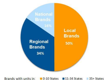
Geographic Distribution of Brands

Furthermore, notwithstanding any popular misapprehensions, franchising consists of far more than merely the “fast food” industry. In fact, 63% of companies that franchise are not in the food services at all, and 83% are not in fast food. 3 As you can see in the graphic below, there are far more local (50% of all franchised brands) and regional brands (34% of all franchised brands) whose names you might not recognize than the fast food giants that garner the most attention.